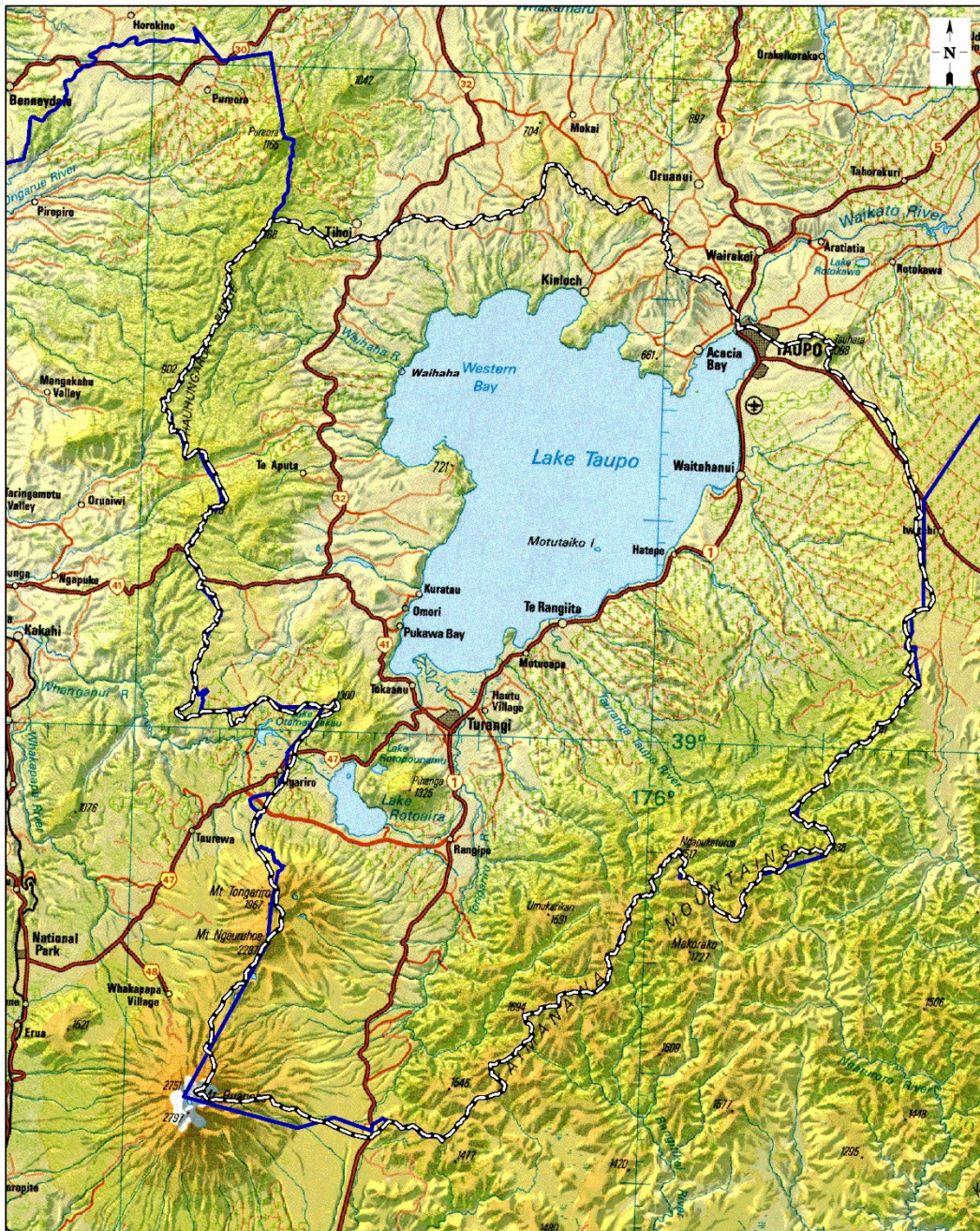
Taupo Catchment Boundary Overview Map