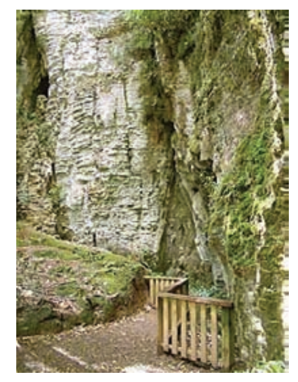
Limestone outcrops, Ruakuri, Waitomo.