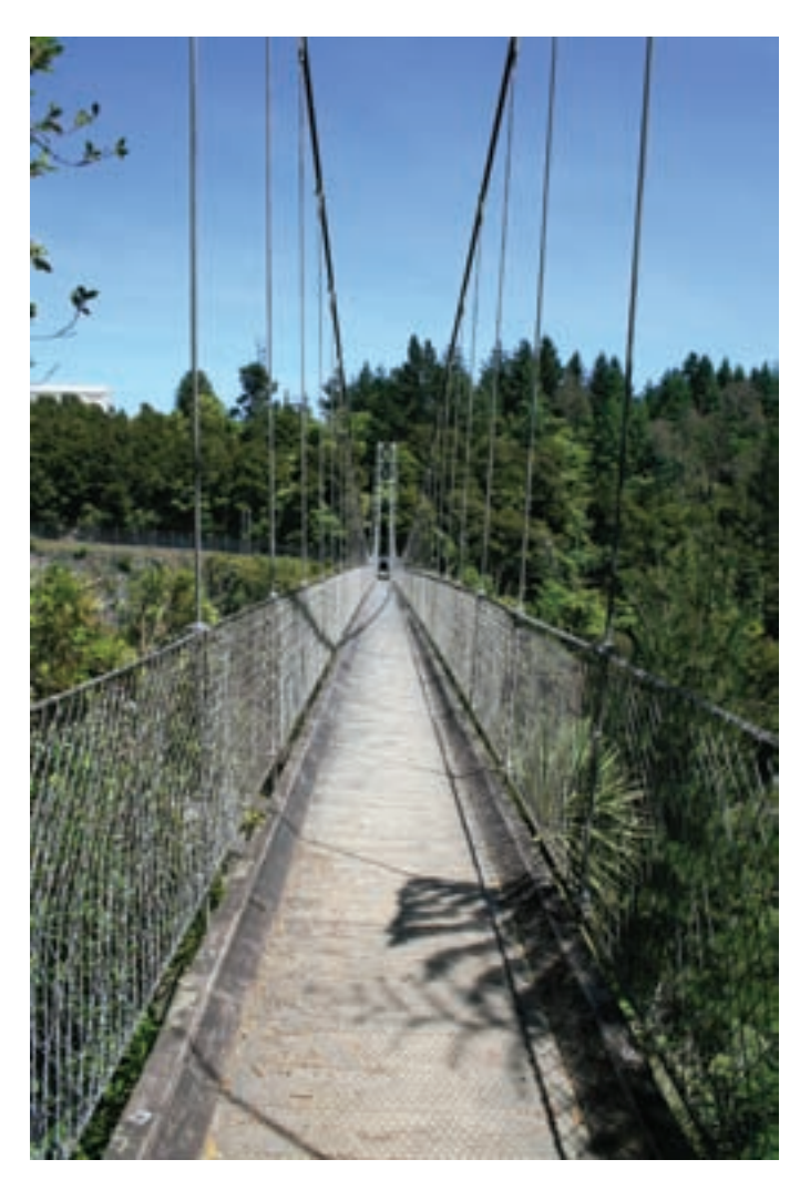
Waikato River Trails, swing bridge, Arapuni.