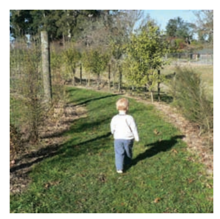
Newstead walkway on the outskirts of Hamilton.