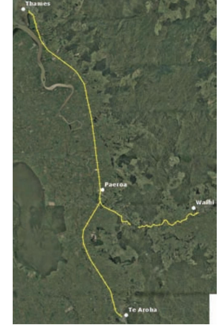
From old rail to new trail.